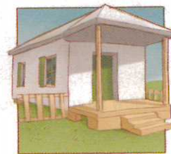
1. a shot-gun house